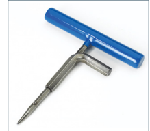
The 'CART' is a specialty tool used to set the torque for all SR preset torque wrenches (P/N 819117).