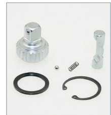
Ratchet Renewal Kit available for all sizes (1/4" up to 3/4").

Option: Can be ordered preset from factory, or you can adjust the torque on your own torque tester ('CART' needed).