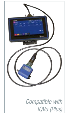
Compatible with IQVu (Plus)