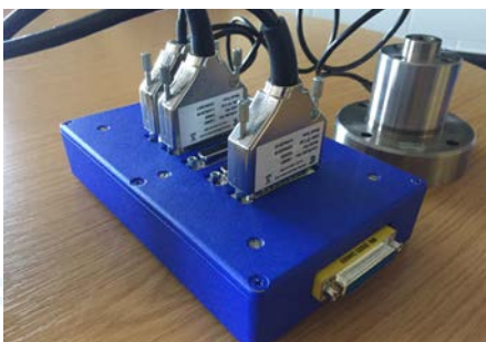
Img. left: Optional Auto Transducer Switch 5-way sensor switch for Crane UTA or Multi sensors. An LED indicates the currently active transducer. The connected Crane meter then suggests the most suitable sensor.