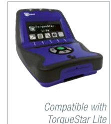
Compatible with TorqueStar Lite