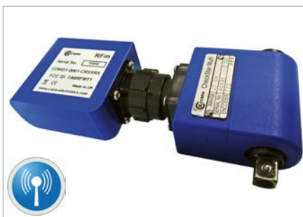
Img. left: CheckStar Multi with radio module „RFm“ for wireless communication with the measuring device.