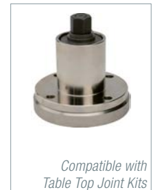
Compatible with Table Top Joint Kits