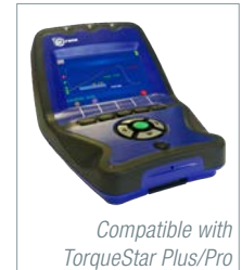
Compatible with TorqueStar Plus/Pro