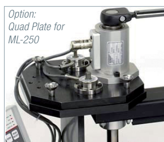
Option: Quad Plate for ML-250