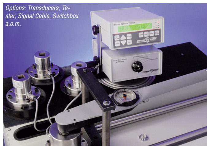
Options: Transducers, Tester, Signal Cable, Switchbox a.o.m.