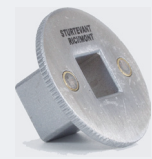
Optional: Square Adapters in misc sizes.