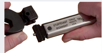
Each SR dovetail head fits on every SR dovetail wrench.