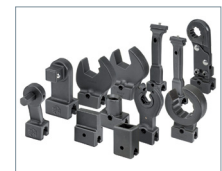
There are over 200 different interchangeable dovetail heads to choose from – any of them fits.