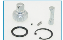
Ratchet Renewal Kit available for all sizes (1/4" up to 3/4").

Option: Quick and easy "Knurl Grip Conversion Kit" available for previous neoprene rubber grip models up to 250 lbf-ft (340 Nm). INFO