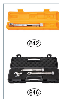
Option: Blow-molded carrying case (colour depends on type/model).

A clear “click” sound by internal toggle mechanism signals tightening completion upon reaching the set torque.