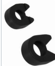
Option: Protective cover for ratchet head.