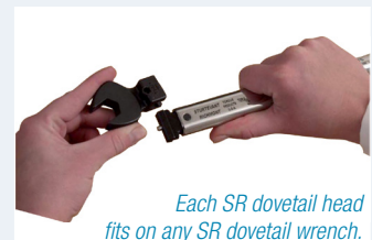
Each SR dovetail head fits on any SR dovetail wrench.

However, when interchanging heads with different centre lines, the torque wrench must be reset resp. re-adjusted each time!