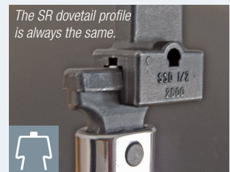
The SR dovetail profile is always the same.