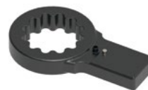
Reaction Bar Adapter