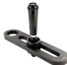
Sliding Reaction Plate