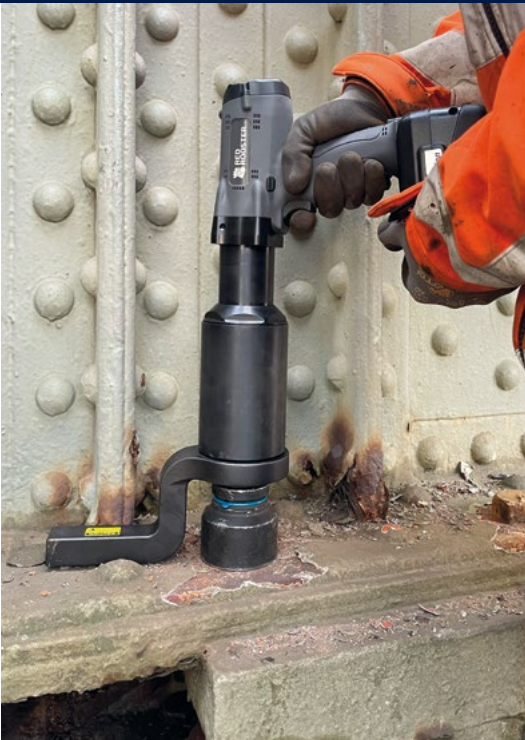
Untightening corroded bolts for construction industry.

A variety of reaction bars and brackets is available, but in case of a need for a tailor made reaction bar, it is possible to share the 3D CAD drawings.