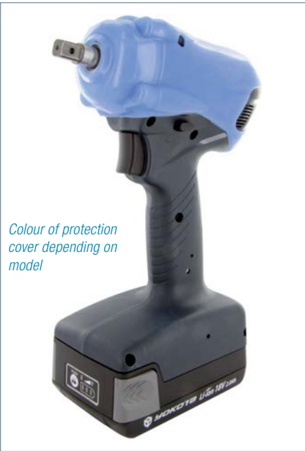
Colour of protection cover depending on model

Yokota YZ-N battery impulse wrenches are powerful, very accurate and most important, have no kick-back. The very compact design offers great accessibility to the joint.