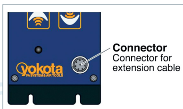
Connector Connector for extension cable