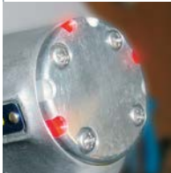
LED status indication (green = OK, red = NOK), visible all around – from above, below, left, right, front, back.