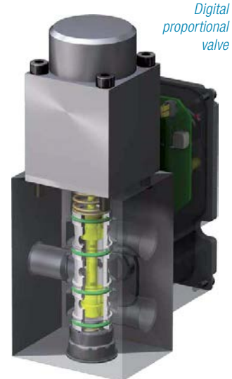
Digital proportional valve