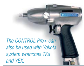
The CONTROL Pro+ can also be used with Yokota system wrenches TKa and YEX.